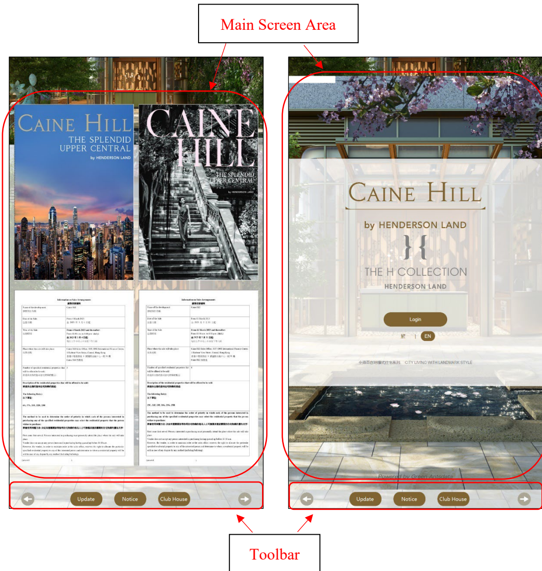
Figure 14: Terminal interface

The LCD display is divided into two functional areas: The Main Screen Area and The Toolbar .